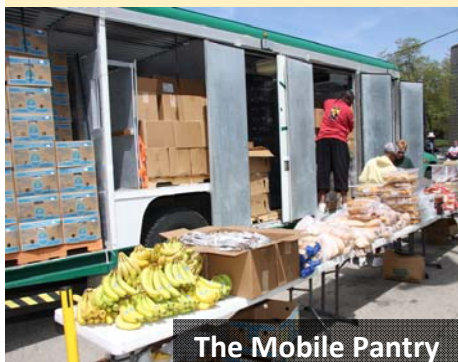
The Mobile Pantry

NIFB's Mobile Pantry , a traveling food pantry with refrigerated bays that can carry up to 10,000 pounds of food made 283 visits in the last year to feed over 52,000 families. With the recent acquisition of a second Mobile Pantry truck, NIFB will be able to increase service to areas and communities under-served by traditional pantries.