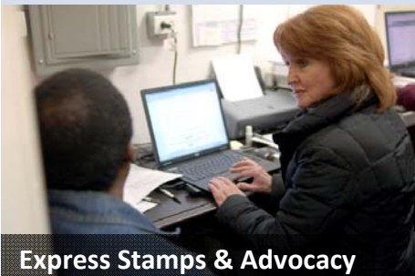
Express Stamps & Advocacy

NIFB's direct distribution programs provided over 30,000 boxes of nutritious food to help reach under-served populations.