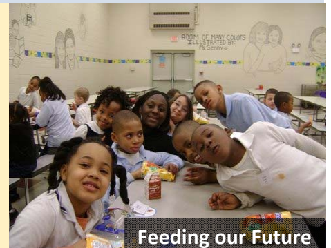
Feeding our Future